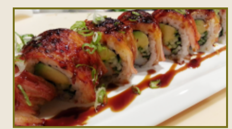
11.95 Rte 18 Baked spicy crab meat on top of california roll with sauce and scallion