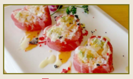
Valentine 🔠 19.95 California roll with crunchy soy paper wrapped with fresh tuna, special sauce, and tobiko