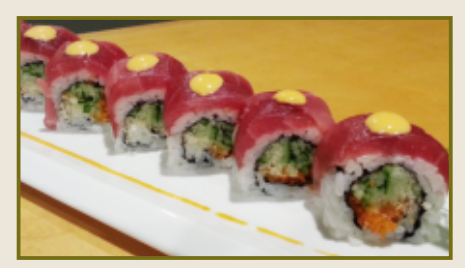
Spicy Crispy Tuna 🛾 🔠 11.95 Cucumber, fish roe, spicy mayo, and tempura flakes inside with tuna on top