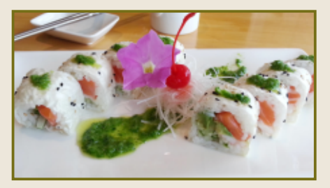
E • B Lady 🗄 13.95 Seasoned soy sheet with fresh salmon, cucumber, avocado, mango, top with mango sauce