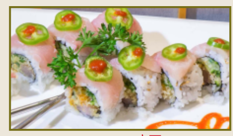
Hamachi Jalepeno 🎙 🖽 14.95 Hamachi, cucumber, roe inside and hamachi outside, topped with spicy sauce and jalepeno