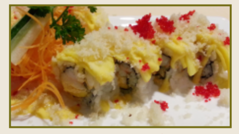
Crispy Mango Shrimp 13.95 Fresh mango, tobiko and tempura flakes on top of shrimp tempura with mango sauce