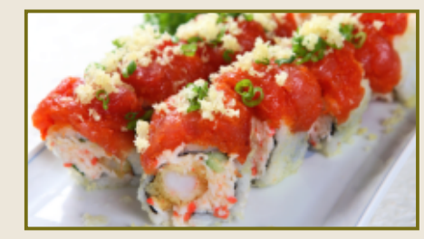
Crazy Fighter 🕻 🔠 15.95 Shrimp tempura topped with fresh spicy tuna, tempura flake, tobiko and scallion