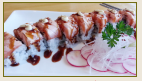
Tuna or Salmon Torch 🛛 🕮 🛛 14.95 Cucumber, roe and spicy mayo inside with seared tuna or salmon on top with mayo and sweet sauce