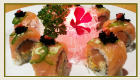
Phoenix 🛚 🗄 14.95 Spicy crispy salmon top with salmon, Jalapeno, black tobiko and chilly sauce