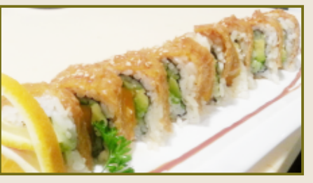
11.95 Vegetarian Sweet fried tofu skin on top of avocado, cucumber & sweet potato