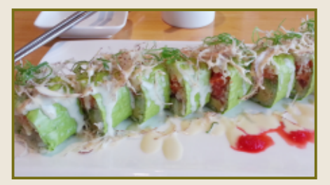
Day Off 🏽 🔠 14.95 Spicy crispy tuna, avocado, tobiko wrapped with green soy sheet, top with fried taro flakes, scallion and special creamy sauce