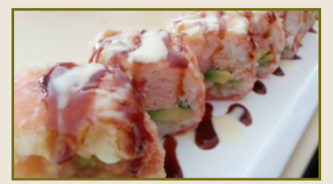
15.95 East Bridgewater Cooked salmon, crab stick, cucumber, avocado and tobiko wrapped with soy sheet. Lightly battered and deep fried, with house special sauce