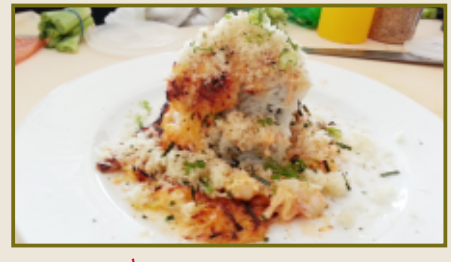
14.95 Volcano 🛛 California Roll topped with baked scallop in chef's special spicy sauce, with tempura flakes and scallion

15.95 Alligator Shrimp tempura roll covered by eel, crab stick, avocado, tobiko and scallions