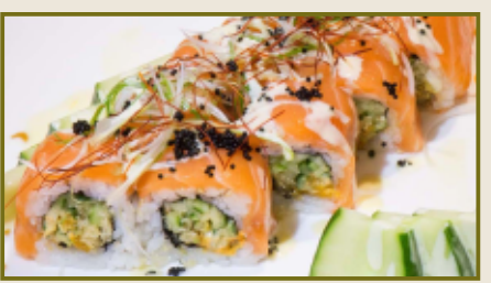
Dancing Queen 🗄 13.95 Cucumber, fish roe, spicy mayo, and tempura flakes inside topped with salmon and tobiko