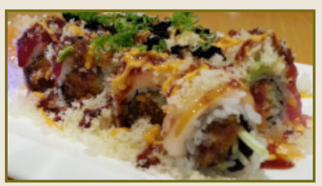
High Wave 🛛 🗄 15.95 Spicy tuna maki topped with tuna and white tuna, avocado, tempura flakes and tobiko with chef special spicy sauce